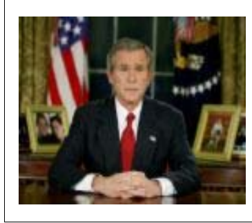
Pres. Bush Signs Proclamation

President George W. Bush sent a letter acknowledging September 2007 as Life Insurance Awareness Month. Thirty-four state governors and Washington, D.C., Mayor Adrian Fenty have signed written proclamations in support of this year's public awareness campaign. In addition, the National Association of Insurance Commissioners and the National Conference of Insurance Legislators signed similar proclamations earlier this year.